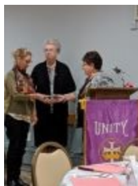
Faith House Presentation

The Annual Memorial Mass organized by the Past Regents Chapter of the Archdiocese of NY was sponsored this year by Ct. Queen of Peace #1534 of Wappingers Falls on Saturday, November 2nd. The Mass was held at St. Mary's Church, 11 Clinton Street and followed by a luncheon at the Knights of Columbus Hall on Rt. 9D. Each year at this Mass the members of all the courts in the Archdiocese who have died since last year's Mass are remembered for their dedication and service to the Order. Also, the PRC's annual donation to the Archdiocesan Seminary at Dunwoodie was announced and will be sent to help with the educational cost of our future Priests. Two $1000 grants were also presented to representatives for Faith House and the Summer Recreation Program at Pallotti Center.